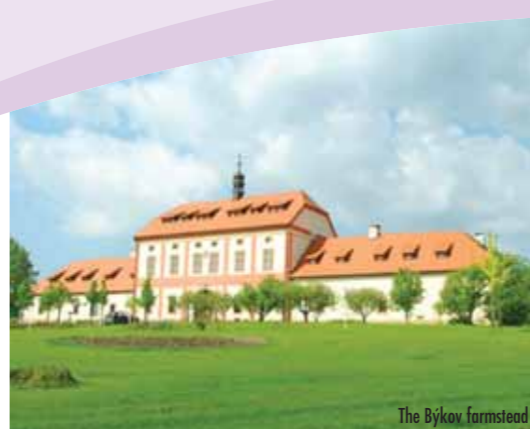
The Býkov farmstead

Contact: Zámeček statek Býkov, 330 04 Hromnice 55, Czech Republic Tel.: +420 377 193 110, fax: +420 377 959 345 www.bykov.cz, bykov.mfc@iol.cz