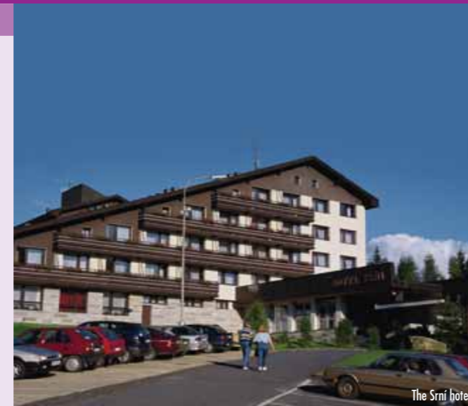
The Srní hotel

Contact: Hotely Srní, Srní 117, 341 92 Kašperské Hory, Czech Republic Tel.: +420 376 599 212, fax: +420 376 599 214 www.hotely-srni.cz, srni@hotely-srni.cz, sumava@hotely-srni.cz