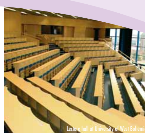
Lecture hall at University of West Bohemia