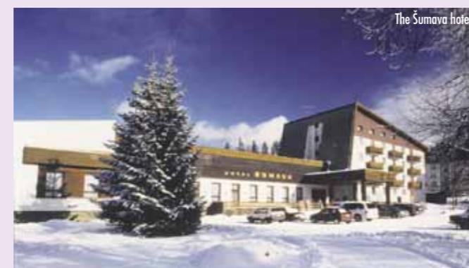
The Šumava hotel