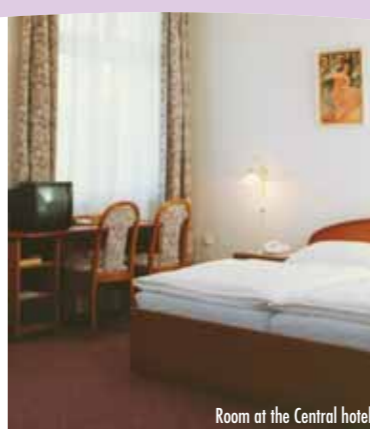
Room at the Central hotel